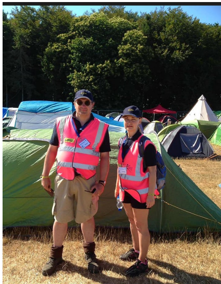
Some of the LTP crew at Latitude