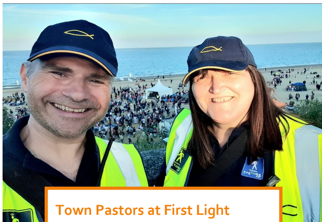
Town Pastors at First Light Festival

I just wanna also say thank you for standing and chatting to me whilst I was alone and cold outside on the bench. It seems like a small thing just saying it but honestly, I felt safe when you were all there with me. I knew that you all done an amazing job as town pastors but you don't truly appreciate it until those time of needs. I'm sorry for the state I was in last night, but I just wanna say, thank you for helping to keep me safe, it meant the world to me xx